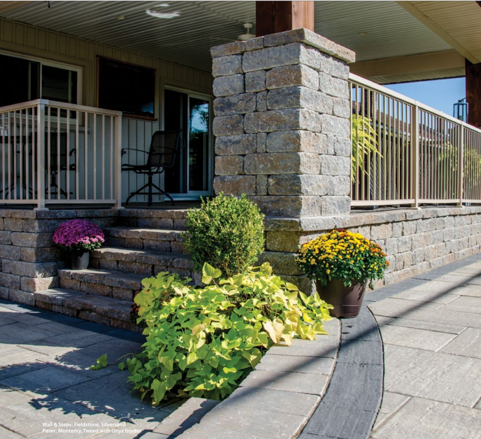
Wall & Steps: Fieldstone, Silversand Paver: Monterey, Tweed with Onyx border

Rough-cut and solidly constructed, Fieldstone products can be installed in either random or structured patterns to creatively enhance garden features such as walls, planters, steps and entrance pillars. Pre-split units are available in a 135mm (5.31") height with a built-in rear retention lip for greater stability.